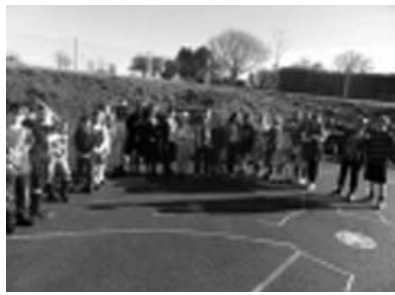
BISHOP WILSON SCHOOL NEWS