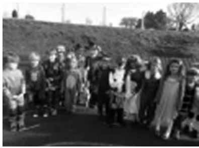
BISHOP WILSON SCHOOL NEWS